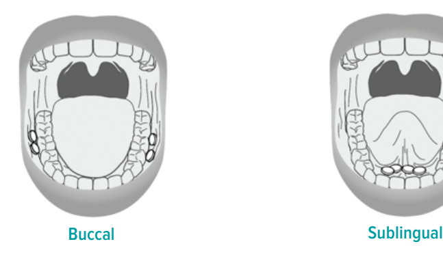
Figure 2.1 Illustration of buccal and sublingual routes of misoprostol administration